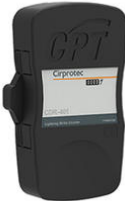
Indicative product image